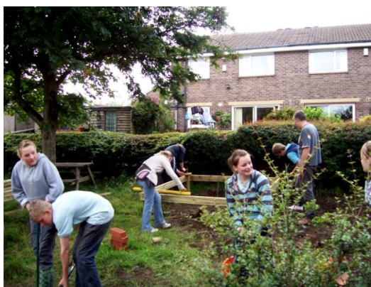
Allotment and Green Group

The school uses assemblies, pastoral time, extra-curricular activities and suspended timetable days very effectively to arrange an excellent programme of stimulating work-related activities. Many of these activities are linked directly to curriculum areas and some operate across subjects. In the recent examples listed below, students had to work with people new to them and in different and often challenging circumstances. They developed excellent employability skills by taking part in tasks, presentations and discussions that were planned as part of each activity.