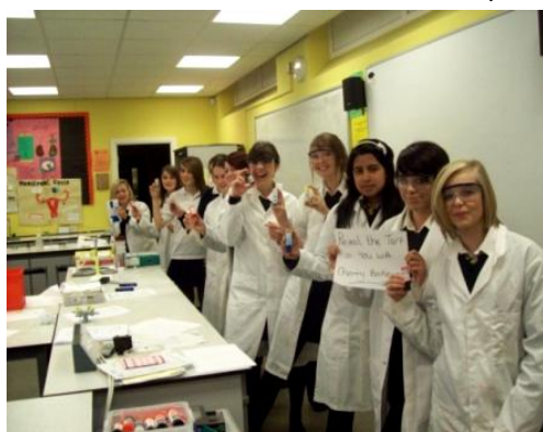
Women into Science and Engineering activities

The same framework is used for an enterprise audit in each subject area: