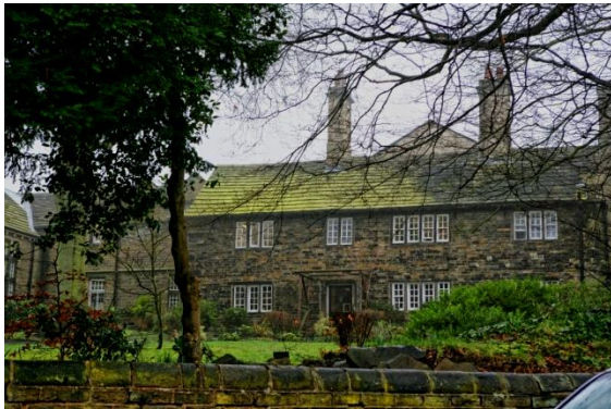
King James’s School, established by Royal Charter, 1608

King James’s School is an average-sized school serving an area on the eastern outskirts of Huddersfield. The proportion of students eligible for free school meals is below average. Most students come from White British backgrounds, with one in eight coming from a wide range of other groups. Almost all students speak English as their first language. The proportion of students with special educational needs and/or disabilities is well below average. The school has specialist status in science and in mathematics.